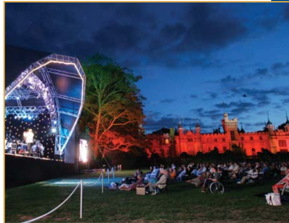
Exclusive corporate concert 2004