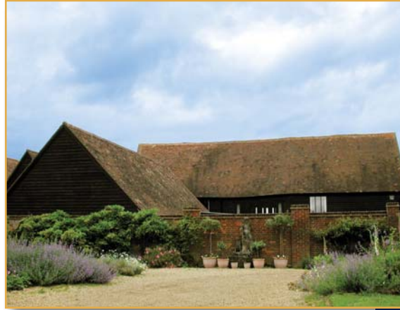
The 16th century Tithe Barns

For floor plans and capacity, please see overleaf