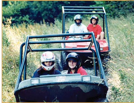
Motorised activities on the Tower Lodge Field

For map of fields and dimensions, please see overleaf